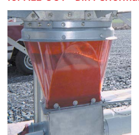
STANDARD with any FLEX-AUGER® Model or 4-inch (102-mm) solid-core auger – Chore-Time's Red Translucent, Polycarbonate Boot Transition offers high strength and impact resistance. Available in straight-out and 30-degree configurations, the transition retrofits to most existing feed bins with 16-inch (406-mm) diameter hopper openings. Optional clear model also available.