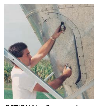
OPTIONAL – By removing a few bolts, our ACCESS PLUS® Door Panel lifts out for easier access to the inside of the bin for cleaning chores between flocks.