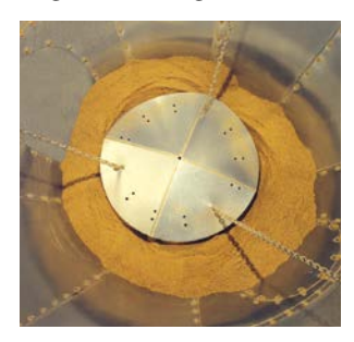
OPTIONAL – Chore-Time's innovative SHAKER-PLATE® Material Flow Control is suspended inside the feed bin's hopper. The SHAKER-PLATE Unit vibrates to create mass flow for the stored feed. The economical-to-operate unit automatically activates whenever the unloading auger is running.