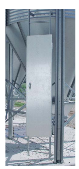
OPTIONAL – Ladder Security Door helps restrict unauthorized access to the feed bin's ladder.