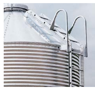
OPTIONAL – Convenient Handrails (patented) are available for our sturdy ladder system.