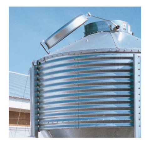
STANDARD – Our SPRING-LOCK® Feed Bin Lid and Opener (patented) aids in biosecurity by permitting bins to be opened from a remote location. Bins are easily opened with one hand, yet feature a positive, spring-aided closing action. When open, the lid slides down and out of the way of the feed truck's auger.