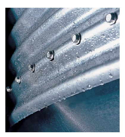
STANDARD – Chore-Time's HYDROSHIELD® Weather Guard directs moisture to drip off the bin's sidewall and helps keep water off the bin's hopper and boot.